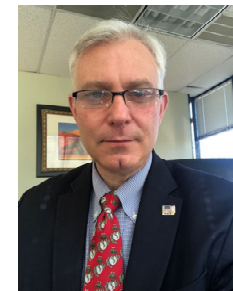
Coleman Nee Department of Massachusetts